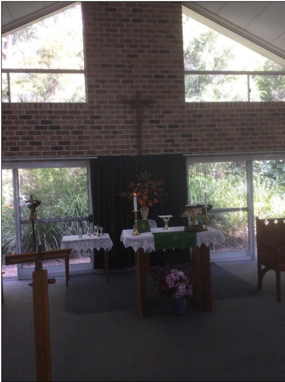
The altar – Mary MacKillop Centre - Beerwah