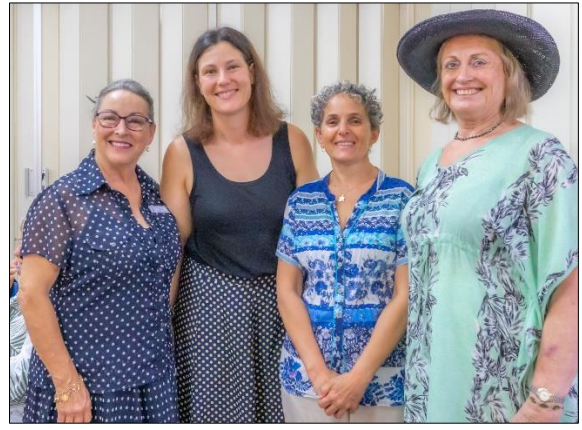
Melbourne Cup Day Celebrations – 1 November 2022