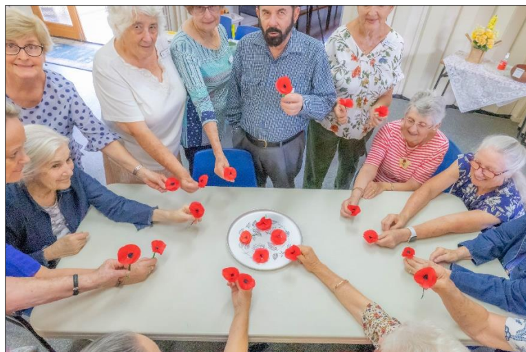
Poppy making at Mothers' Union for Remembrance Day – 8 November 2022